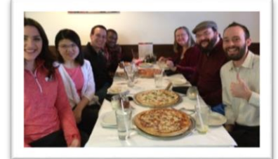
Top: Cincinnati Skyline Chili with CCO Candidate & Pastor Bottom: Pizza with CCO Candidate & OSU Students

To support this ministry please send gifts to: