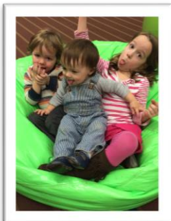
"The Wacky Trio at Jubilee"

www.thematteshome.com (Includes Newsletter Archive & Financial Support Updates)