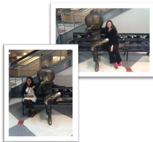
CCO Candidates enjoy a moment with the Ohio State University's mascot, Brutus the Buckeye, in the Ohio Union.