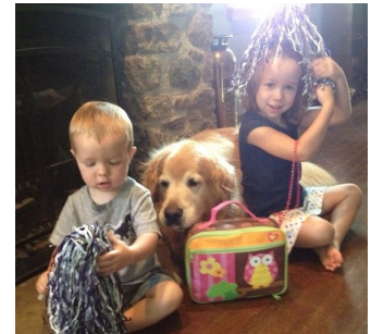
"Excited for the start of another school year!"