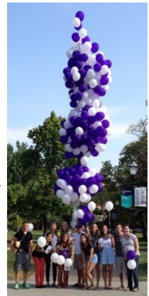
Balloon Give-Away @ Capital University