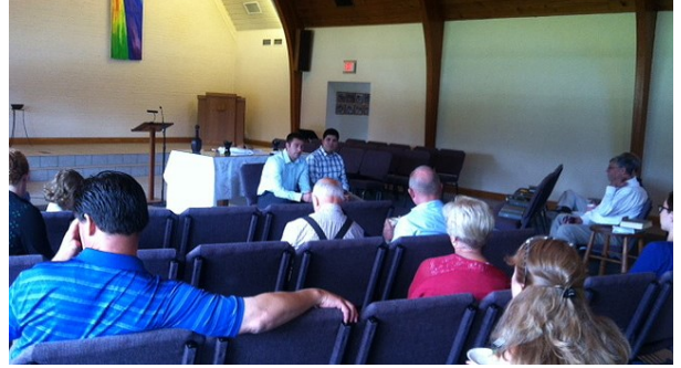
CCO Staff answer questions and share with a local church close to OSU what ministry looks like in their respective church partnerships.

A small church in Columbus is considering this huge leap of faith! Two Ohio CCO staff joined me in offering words of encouragement as they discern partnering with CCO. We were asked by this church: Why does the CCO partner with churches? Why would students want to be a part of our church community? My answer was simple: I believe that a local church is uniquely equipped to encourage college students to wrestle more deeply in their understanding of Christ's Lordship over every area of life through worshipping with, serving alongside and enjoying the hospitality offered by a diverse congregation of Christ-followers. Please join me in praying that this church (and others) will partner with the CCO to transform the lives of college students.