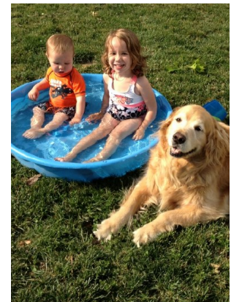
"Summer Pool Party!"

Read Jessica's Blog: hargisjourney.wordpress.com