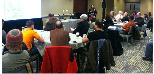
Jubilee: Ministry Partner Event, Bridging the