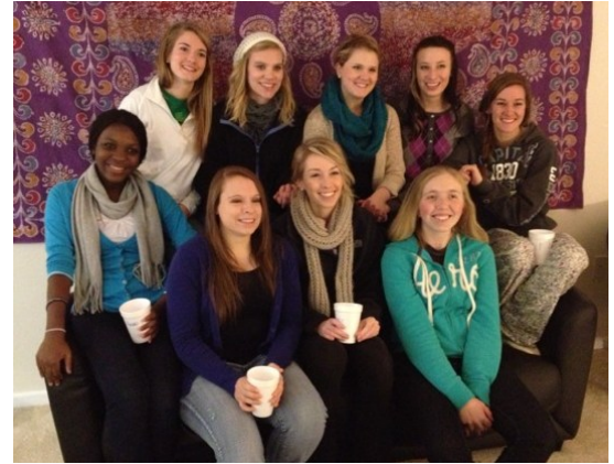
Most of the young women who joined us for Renew Women's "Spa Night"