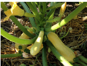
Our Summer Squash!

Many have asked how are community garden plot is doing this summer... We have an incredible crop of vegetables growing this year with a new addition to the garden — summer squash. Gardening will always be a great metaphor for ministry. The soil takes a great deal of tilling and preparation even before the seeds go into the ground and there are always a few unexpected rocks. Once the seeds are in, there is a period of waiting and anticipation. Then there is the constant watering, even when it seems like nothing is happening. It is a good lesson in patience. Finally, after much work and sweat, a beautiful crop is ready to be harvested. They are more splendid than we could have imagined and able to provide great fulfillment to make you look forward to the next panting season. Through it all you realize how remarkably little you actually control in gardening and how much reliance one must have in God's providence from start to finish.