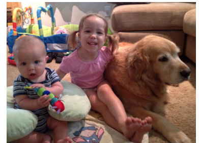
"Sometimes we must stay in due to extreme heat"