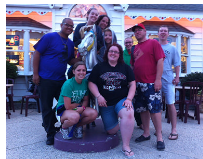
Ohio Students & Staff @ OCBP

To learn more about OCBP 2012, visit: www.ccojubilee.org (Click on OCBP)