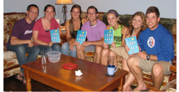
Our Capital Student Book Study