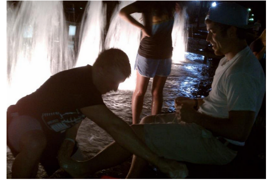
Capital students involved in Renew hold a foot washing at the fountains on Capital's Campus

The students are certainly thinking outside the box with their activities and promoting a spirit of fun and laughter as they live more faithfully into the application of the small group studies! This excitement has also helped them invite friends to come get involved in our ministry. The students are beginning to see that being a thoughtful and whimsical Christian is contagious!