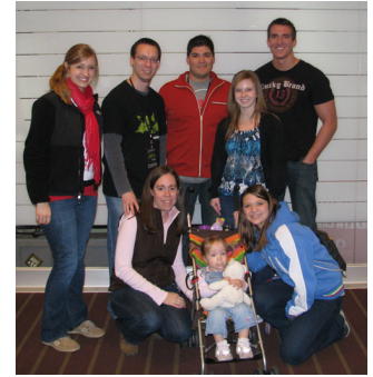
Our Ohio State Jubilee Crew (and one Cedarville student).

Please pray that my follow-up conversations with current and potential partners will bear fruit and opportunities for us to reach more students on campuses we currently serve and on new campuses throughout Ohio. Thank you for your prayers.