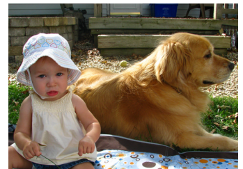
"It is sad to think that summer is now over..."