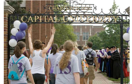
Each class celebrated the return to campus for the new school year.