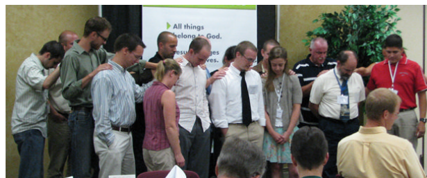
Ohio CCO Team Prays for Ohio CCO New Staff.

This past summer, I had the privilege to teach at CCO New Staff Training to prepare another class of CCO staff for their call into campus ministry. Each year I am impressed with our "new class" of CCO staff and the gifts which