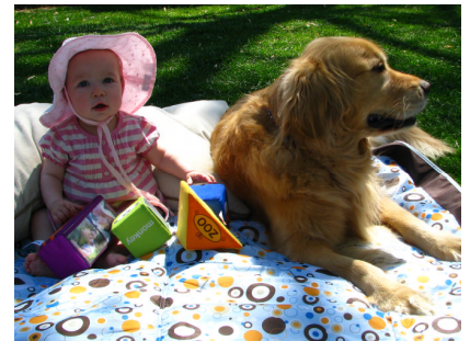
"Chillin' with Lucy on a beautiful Spring day..."