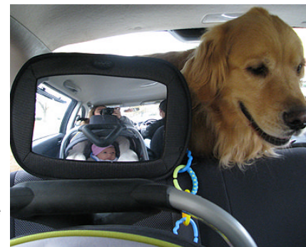
"Car rides with a car seat change things up a bit..."

We are thankful for the generosity of the body of Christ in partnering with us in transforming college students to transform the world. We praise God for every dollar given. We understand that this past year has been financially challenging for many. We know that God is good and faithful; and He will meet all our (and all your) needs. We pray for that assurance daily. Would you consider making a special financial gift this Christmas to help us continue in our call to transform the lives of college students? Your financial gifts help us serve with the CCO at Ohio State and on campuses throughout the state of Ohio, as we seek the transformation of students' lives and this world through the Gospel of Jesus Christ.