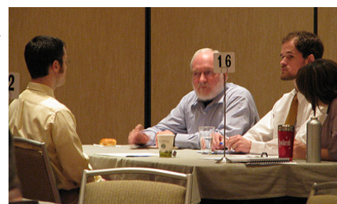
OWU Position Representatives (right) meet with a CCO Candidate (Left) at PPE

tives to help them process through their candidate choices. At the end of the PPE candidates gave their top choices and position representatives did the same. It is from this point that the recruiting department of the CCO works to match candidate and position top choices. This information has been passed along to myself and the other Area Directors and we are now in the midst of setting up the first round of on-site interviews. I am excited for the three exceptional CCO candidates that I have coming to visit OWU to have a more in-depth interview with the Chaplain's Office in the month of March. Please continue to keep our entire discernment process in prayer as God continue to build upon the legacy and ministry of the CCO at OWU.