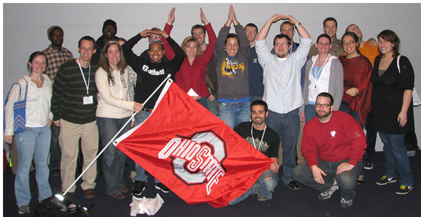
Jubilee 2009: Ohio State Group Photo (Special Note: Not all of Ohio State group was present for this photo...)

'One of the greatest challenges in life is recognizing your calling' ... This point from Jubilee had the greatest impact on my life. Many times in my life I have seen the great work of the Lord and it makes me think of the possibilities involved in a life devoted to Him. The unfortunate reality of my life lies in my own desires for fortune and excitement. I feel a calling toward a life in service ministry and Jubilee played a large role in making that calling blatantly obvious. God wants "Every Square Inch" of our lives and Jubilee has made this very clear to me and hopefully I will listen to my call this time and do as I am told by God.