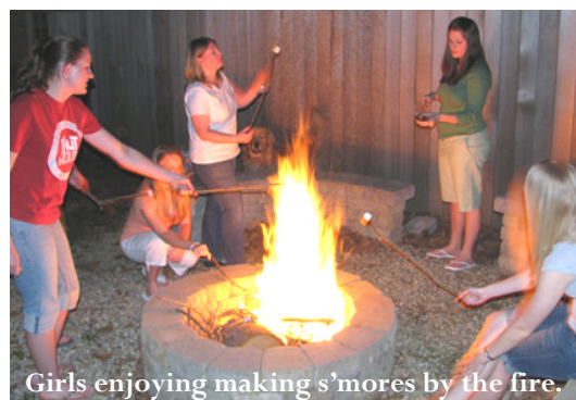
Girls enjoying making s'mores by the fire.

I have been talking with the girls about doing a “girls night” and they all got excited to come over to our new house and spend an evening together. I had about six girls come over to the house and we all cooked and ate a spaghetti dinner together. It was fun to watch the girls each take part in making the meal together. Many of them live in the dorm so they are unable to have “home cooked meals”, so this was a real treat. After cleaning up from the meal we played Apples to Apples which helped us to get to know each other better - as well as laugh together. As it got dark we went outside to our backyard and